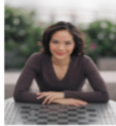
Vivian Fung Composer